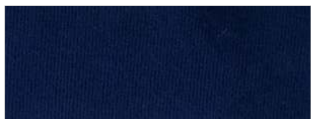
MERASA | 137