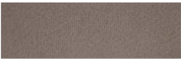
MERASA | 119