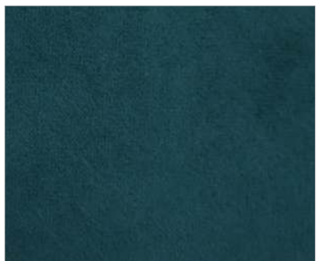
MERASA | 132