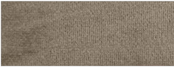
MERASA | 143