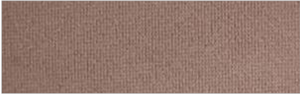
MERASA | 122