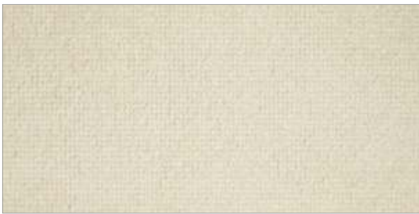
MERASA | 102