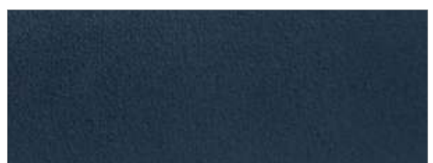
MERASA | 139