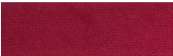
MERASA | 116