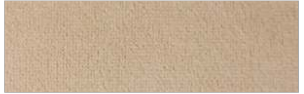
MERASA | 123