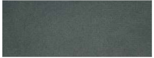
MERASA | 130