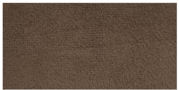
MERASA | 110