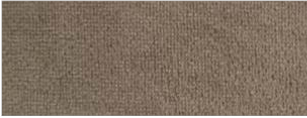
MERASA | 107