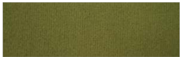
MERASA | 127