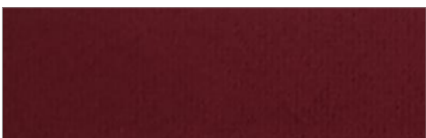
MERASA | 118