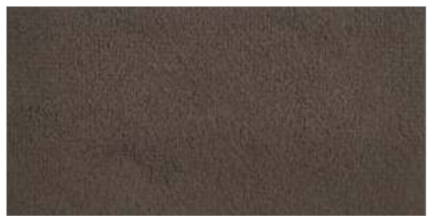
MERASA | 142