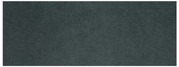
MERASA | 131