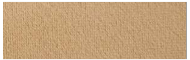
MERASA | 125