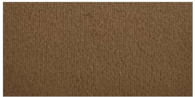
MERASA | 112