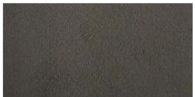
MERASA | 141