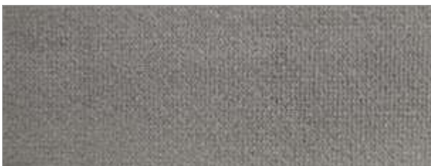
MERASA | 146