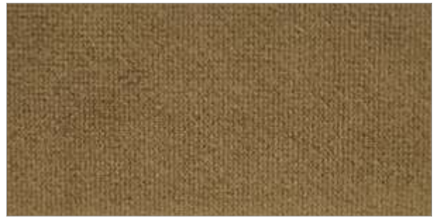
MERASA | 111