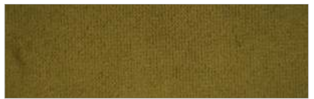
MERASA | 126