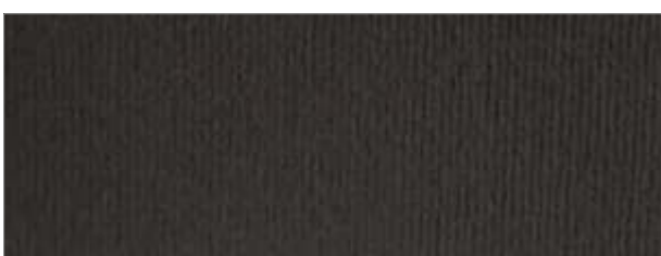
MERASA | 149