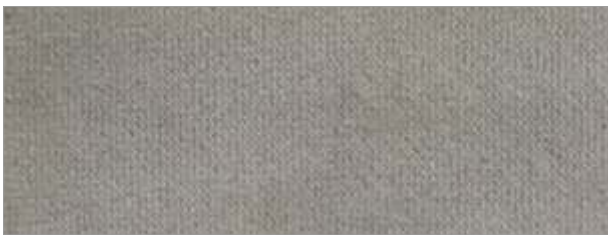
MERASA | 145