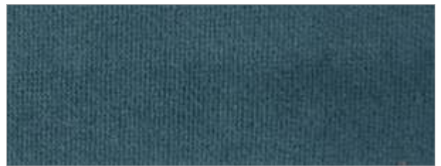
MERASA | 134