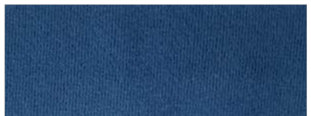
MERASA | 136