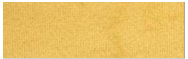
MERASA | 124