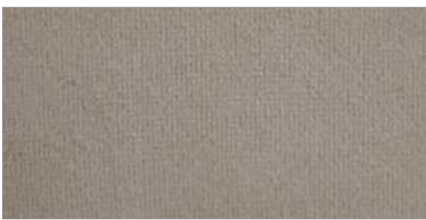
MERASA | 104