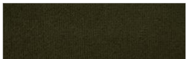
MERASA | 129