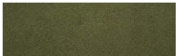
MERASA | 128