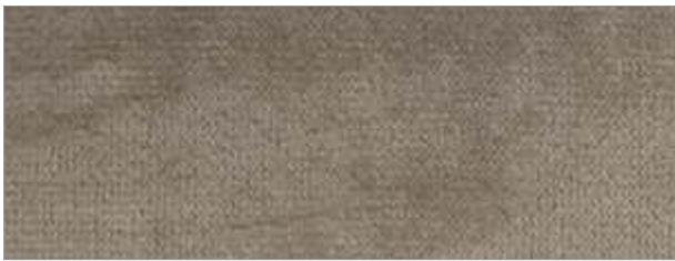
MERASA | 144