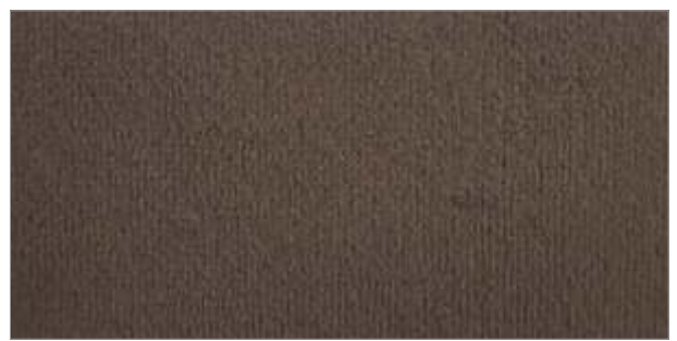
MERASA | 108