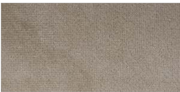
MERASA | 105