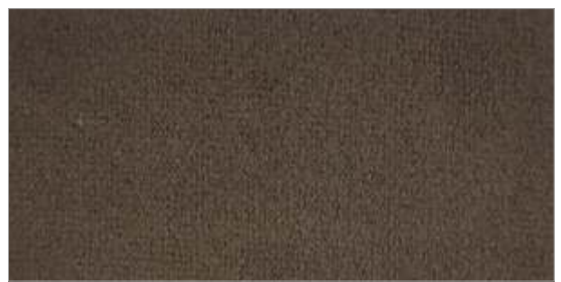
MERASA | 109