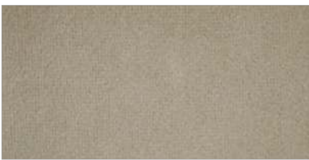
MERASA | 103