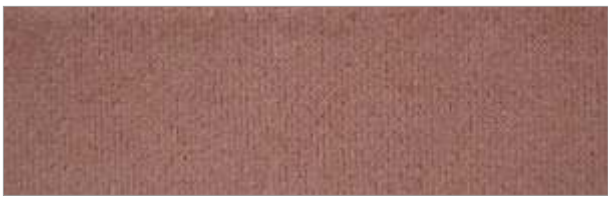
MERASA | 121