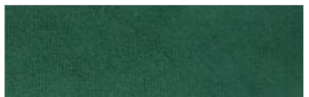
MERASA | 133