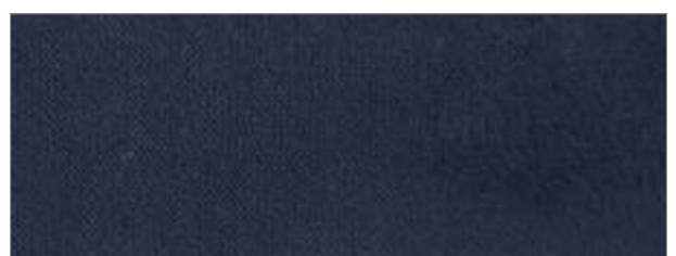
MERASA | 138