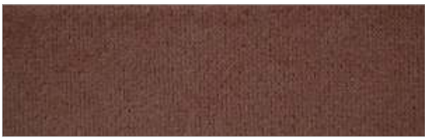
MERASA | 120