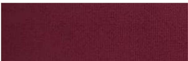
MERASA | 117