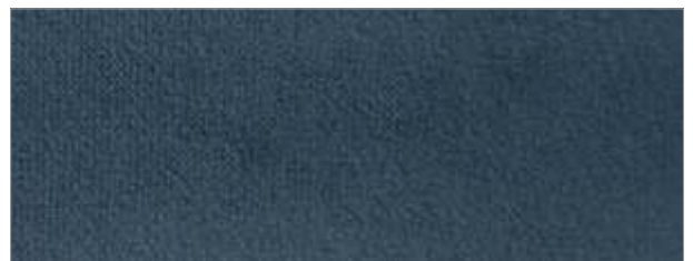
MERASA | 140