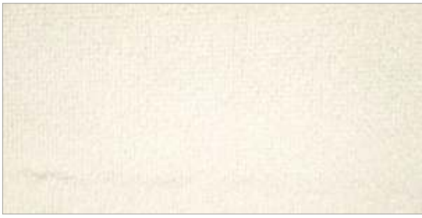
MERASA | 101