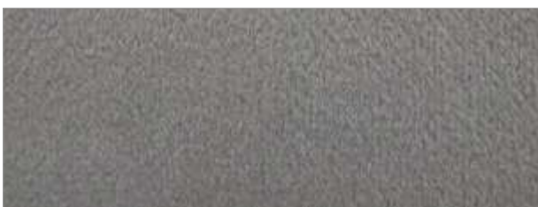
MERASA | 147