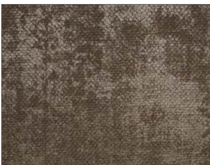
AMIGO | 706