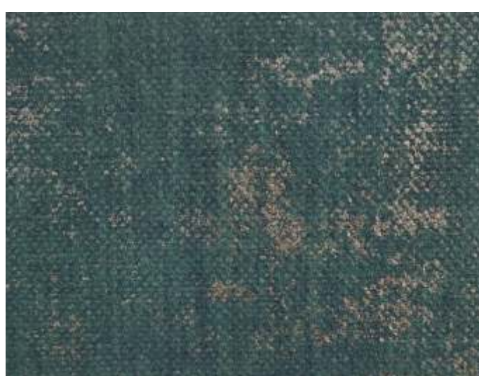
AMIGO | 714