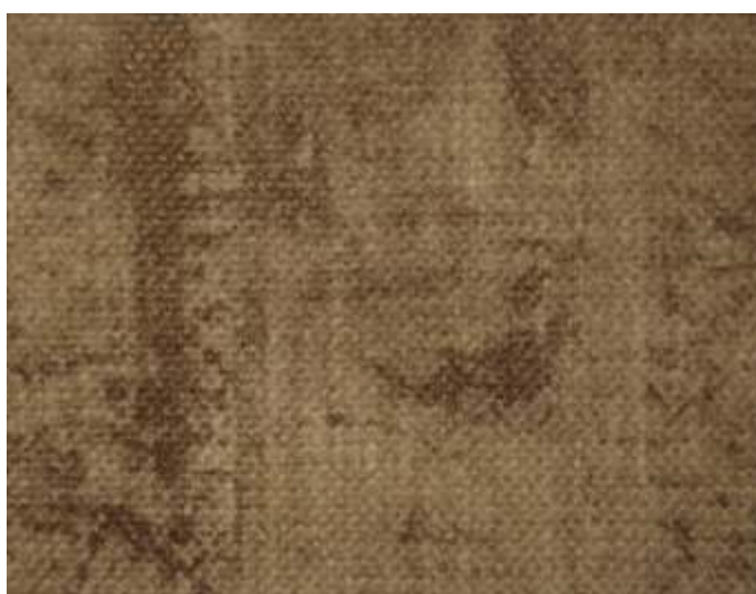
AMIGO | 705