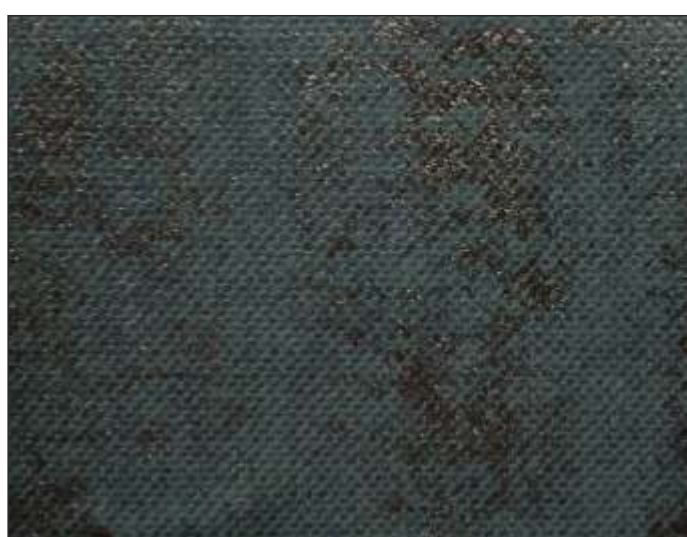
AMIGO | 717