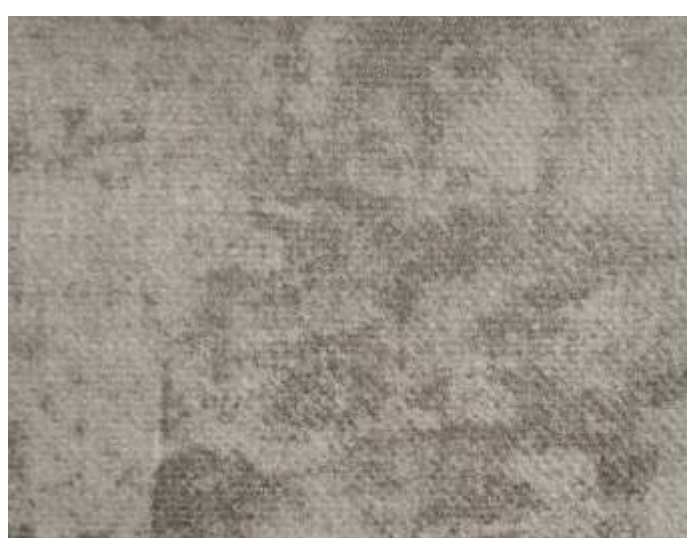
AMIGO | 719