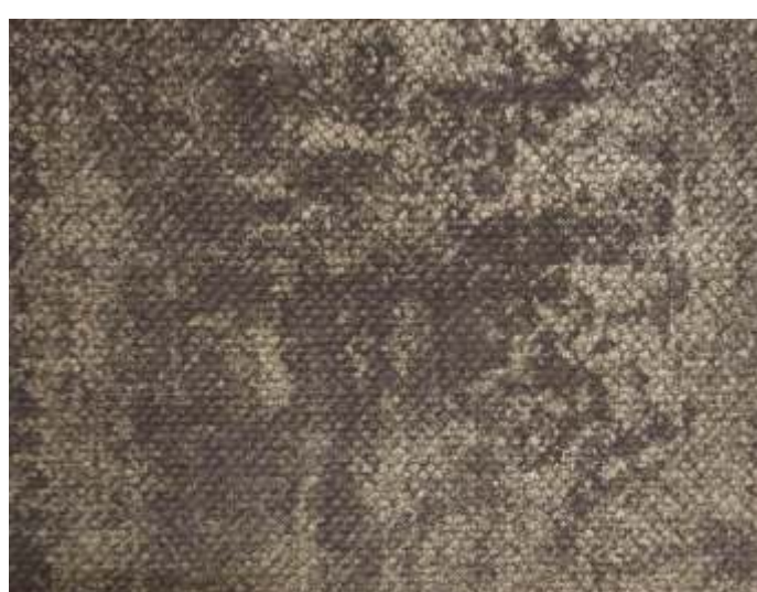
AMIGO | 724