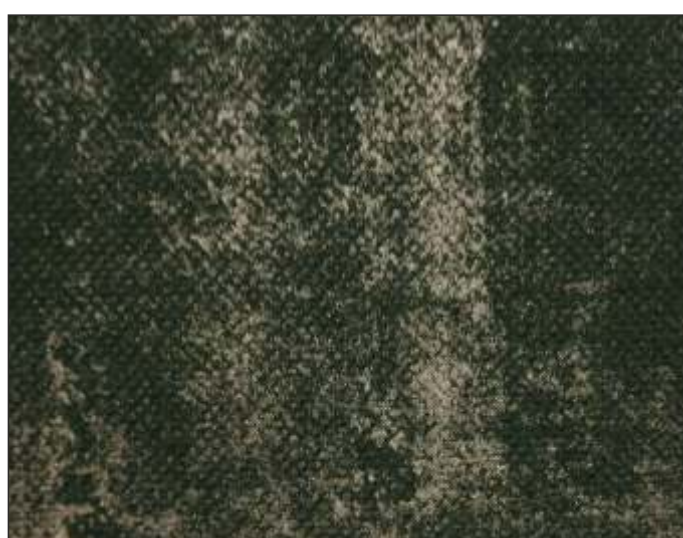
AMIGO | 713