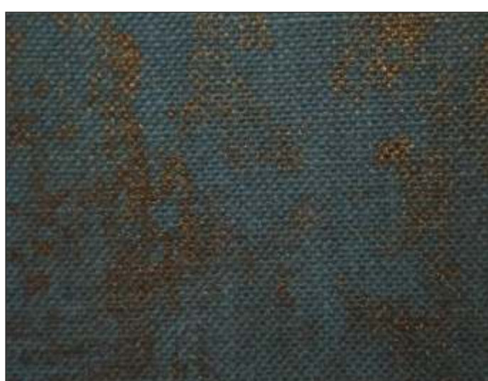
AMIGO | 716