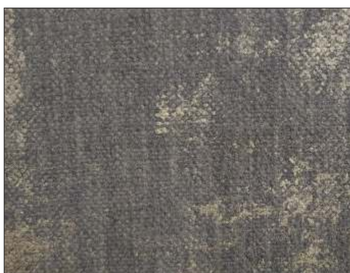
AMIGO | 727