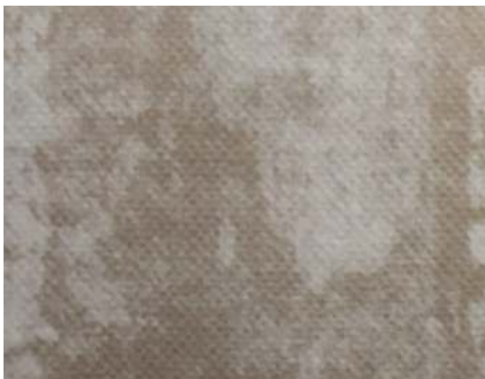
AMIGO | 702