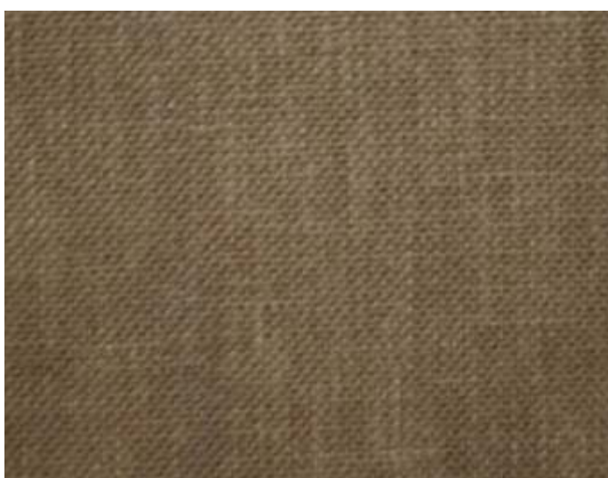
AMIGO | 704