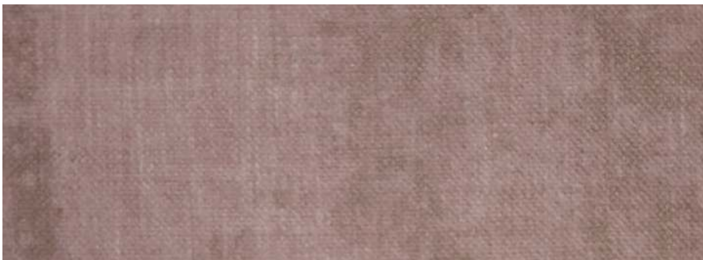
AMIGO | 710