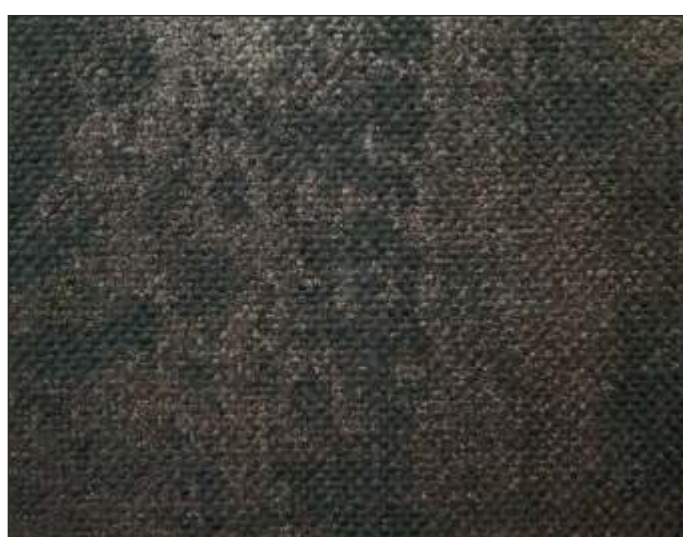
AMIGO | 715