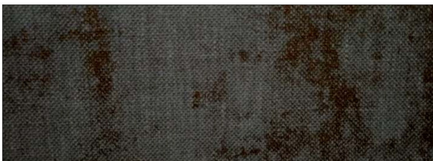
AMIGO | 723