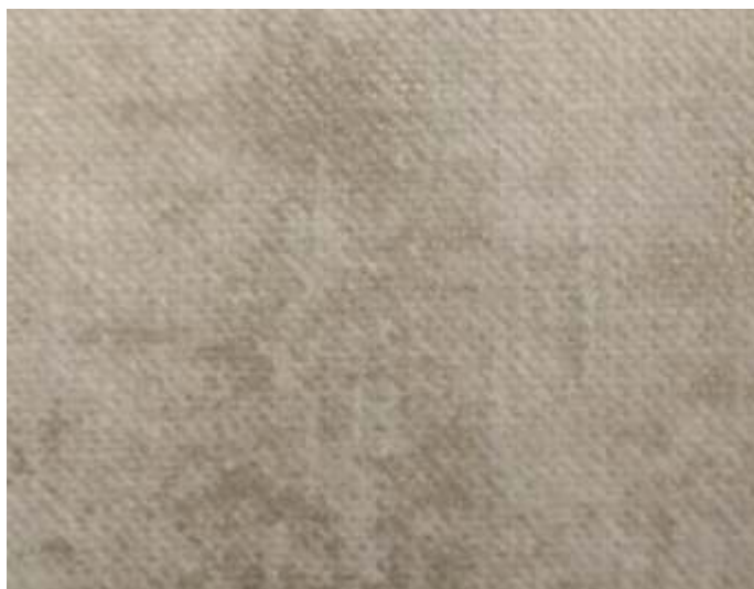
AMIGO | 703