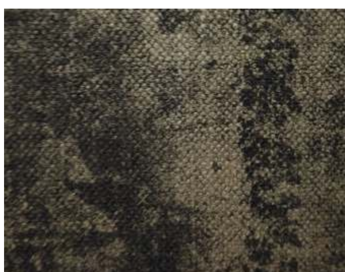
AMIGO | 725