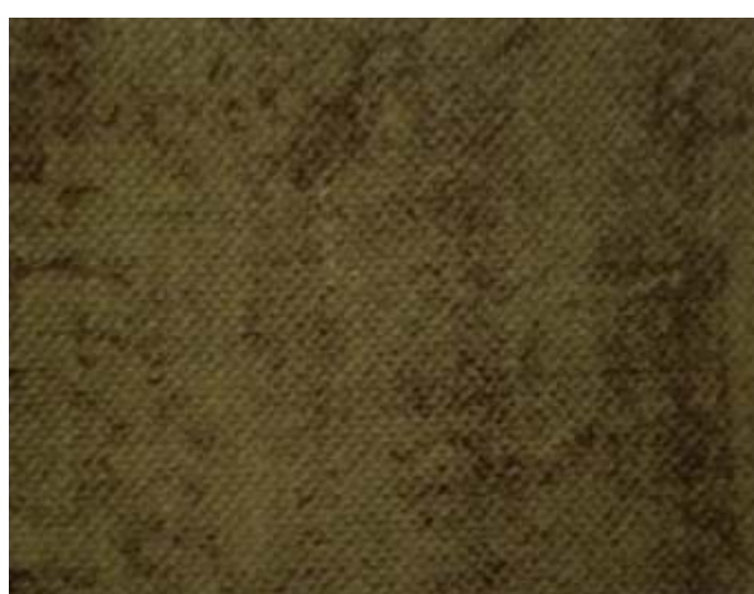
AMIGO | 712