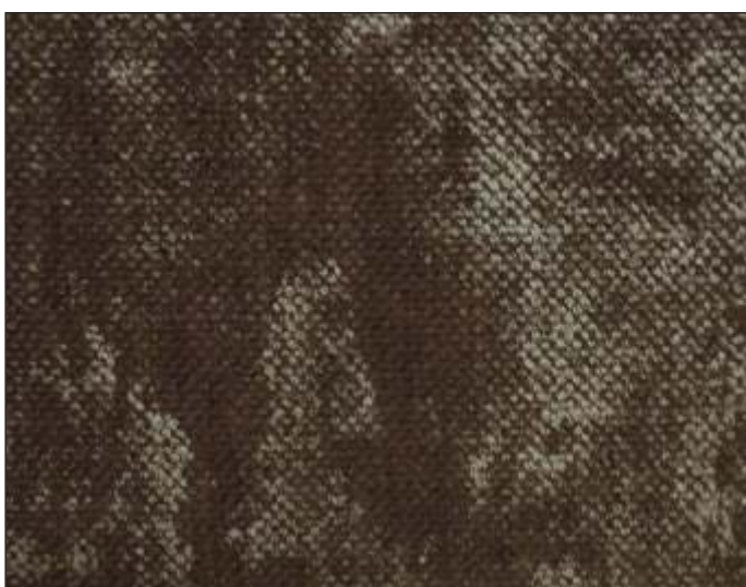
AMIGO | 708