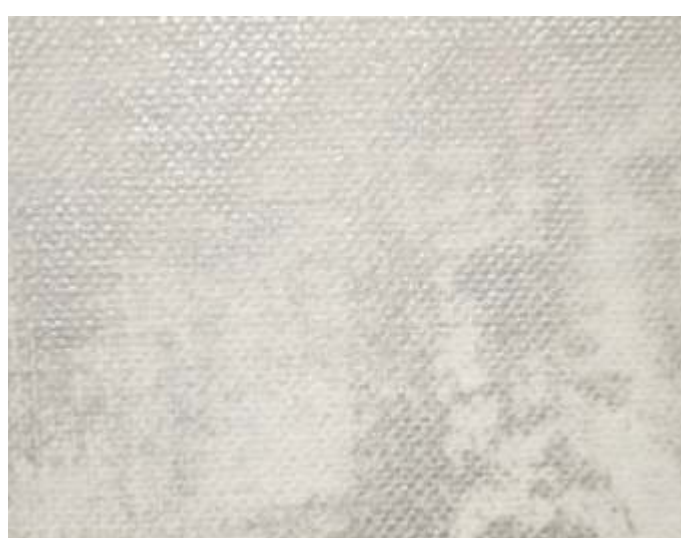
AMIGO | 701