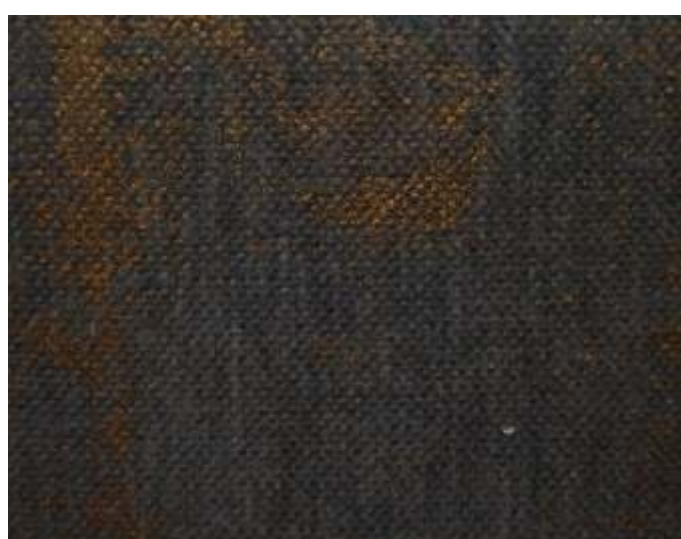
AMIGO | 726