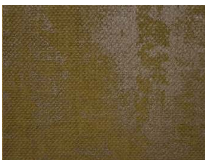
AMIGO | 711