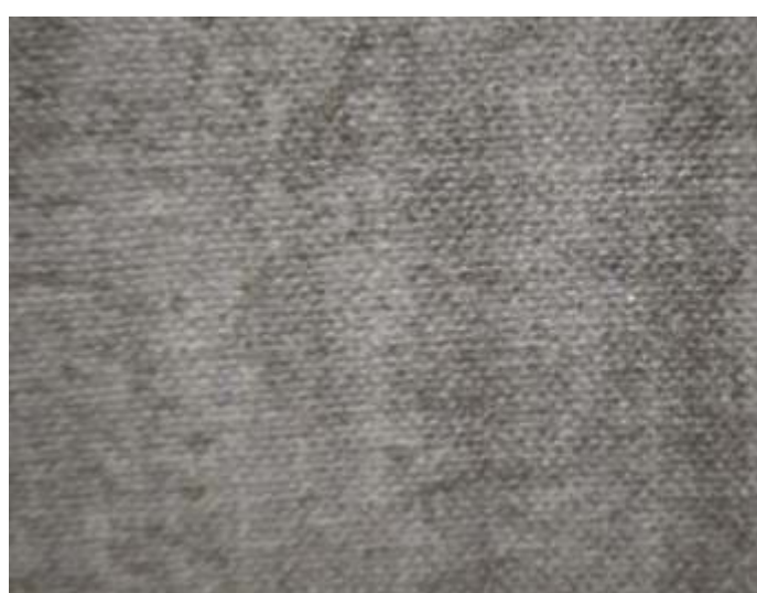
AMIGO | 721