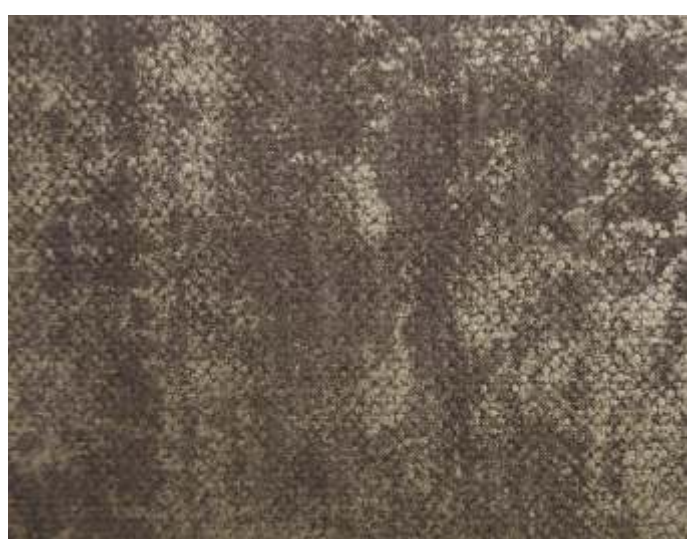
AMIGO | 707