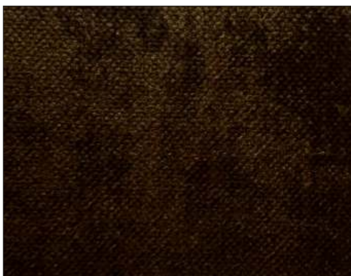
AMIGO | 728