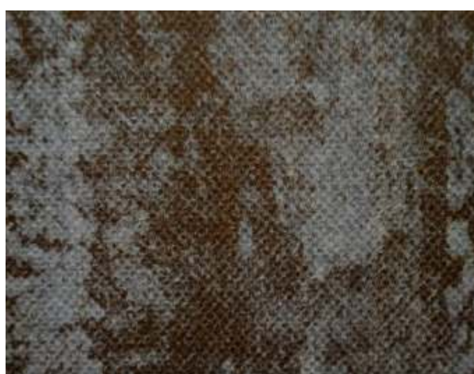
AMIGO | 722