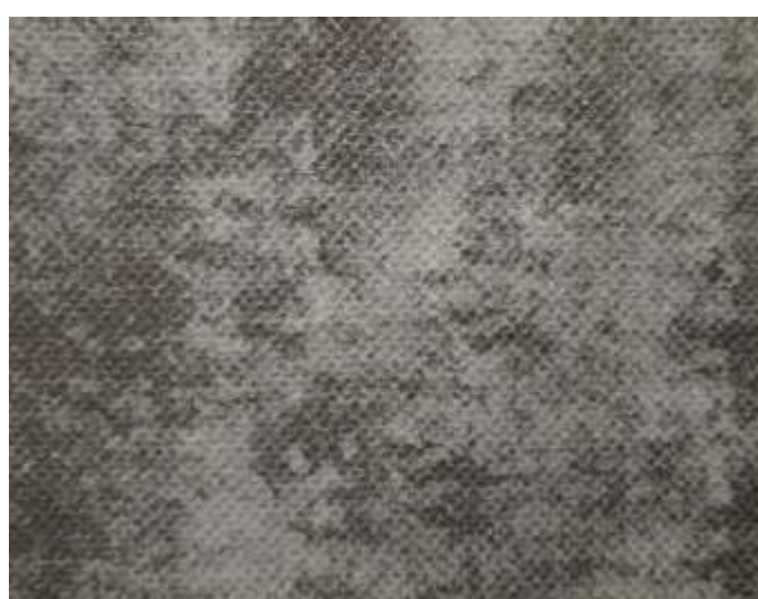
AMIGO | 720