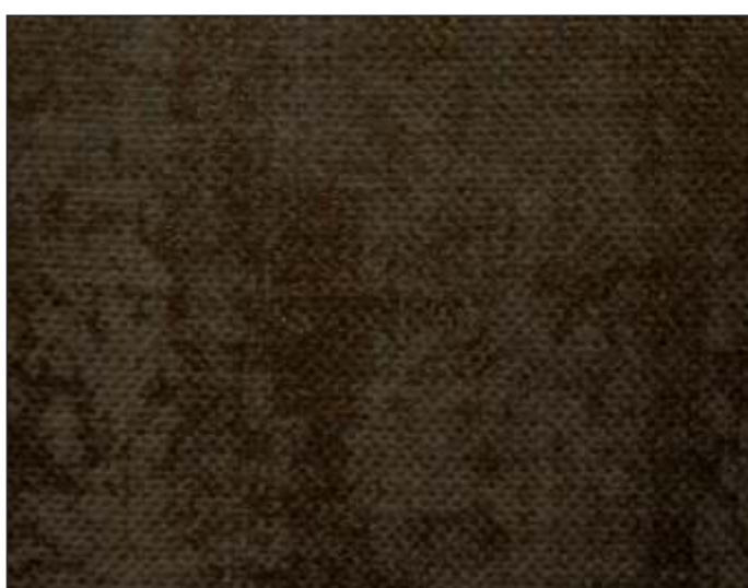
AMIGO | 709